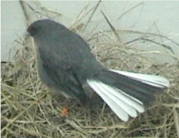
Fig. 1 Tail spreading behaviour of a male dark-eyed junco. During courtship, males erect their body plumage and spread their tail to reveal the white patch on their outer tail feathers, which is mostly hidden at rest. Testosterone increases the frequency of this display, and increasing the size of the patch increases its attractiveness to females. Males also display their tails during intrasexual interactions, and males with more tail white are socially dominant.

behaviour. This covariation between signal, physiology and behaviour would suggest that potential competitors and mates should be able to predict the outcome of interactions with an individual by assessing his ornamentation.